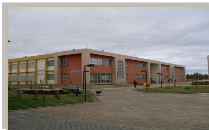
Anísio Teixeira Multidisciplinary Health Institute Campus (IMS / CAT)

Address: Rio de Contas St., 58, qd. 17, It. 58, Candeias, Vitória da Conquistas – Bahia – Brazil