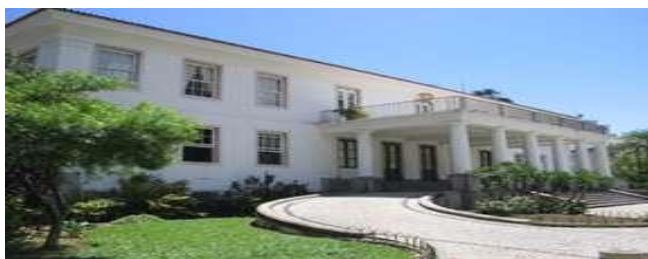
UFBA Main Administration Building (Reitoria)