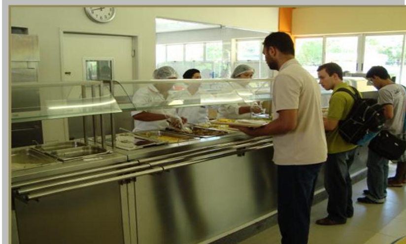
Students having lunch at UFBA's RU.

The UFBA's University cafeteria (Restaurante Universitário – RU), located on the Ondina Campus, provides students, professors and staff three daily meals at affordable prices. Every morning up to 500 people eat at the RU.