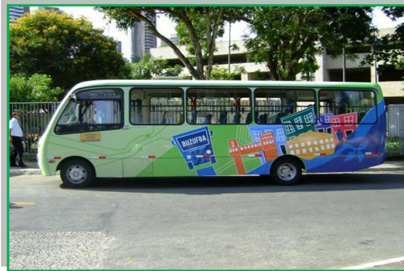
BUZUFBA serves only UFBA students.

BUZUFBA, a free intercampus transportation system, is a set of 4 small buses encompassing 27 seats, and capacity for 13 more standing passengers. The BUZUFBA began running in August 2012. All the vehicles have wheelchair access.