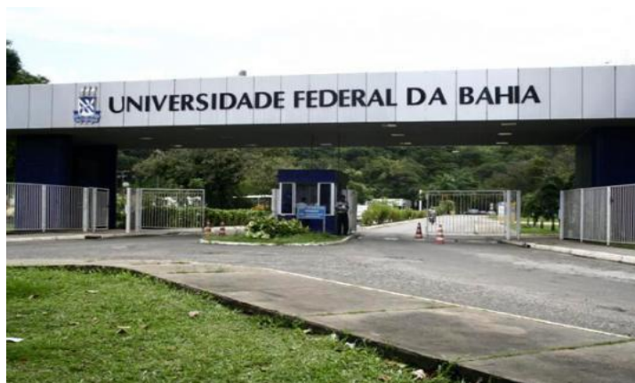
UFBA's main gate

Address: Rua Barão de Jeremoabo, s/n, Ondina , 40170-115 , Salvador – Bahia – Brazil